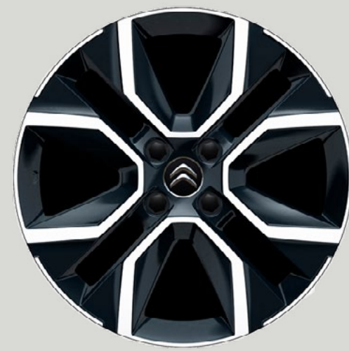
18 inch diamond-cut 'Crosslight' alloy wheels