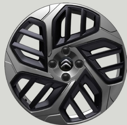
18 inch painted bi-tone 'Aeroblade' alloy wheels