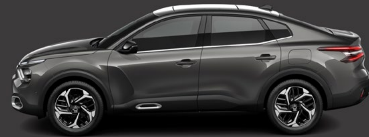
Platinum Grey (M)