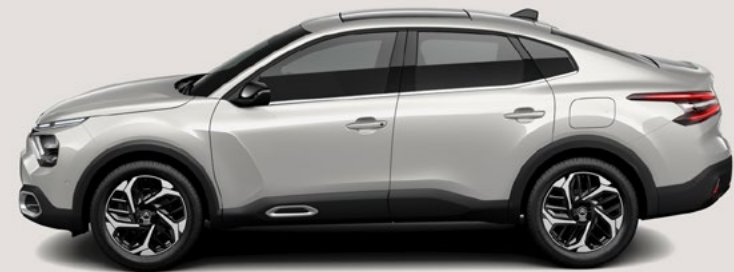
Pearl White (P)