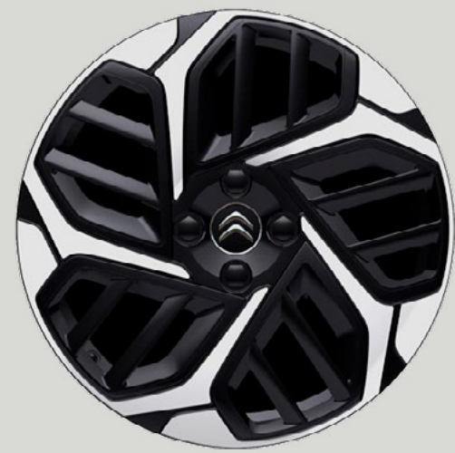
18 inch diamond-cut 'Aeroblade' alloy wheels