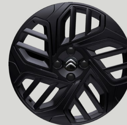
18 inch Onyx Black 'Aeroblade' alloy wheels