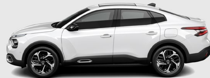
Polar White (F)