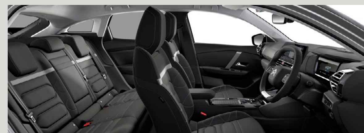
Hype Black ambience