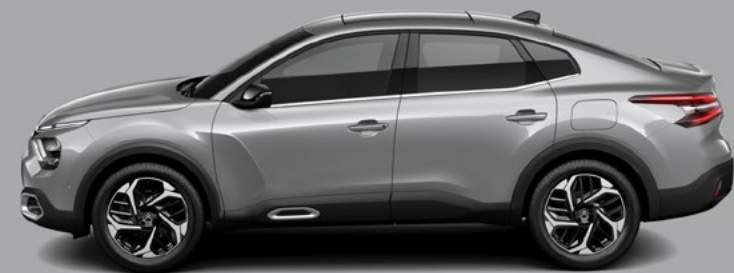
Cumulus Grey (M)