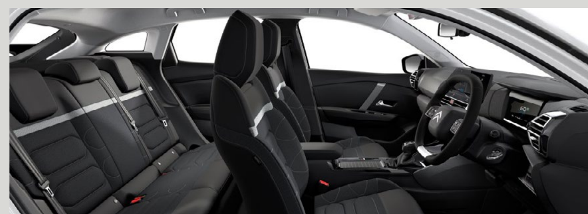
Urban Grey ambience