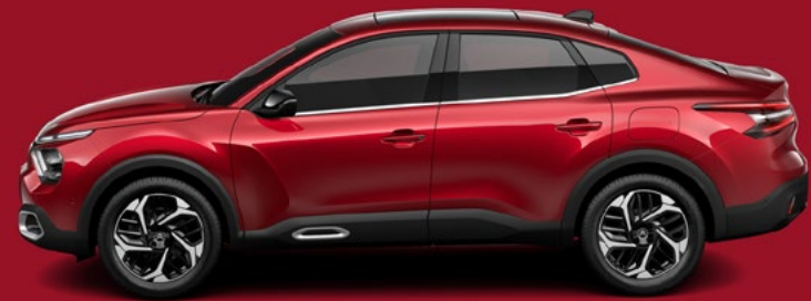
Elixir Red (PM)